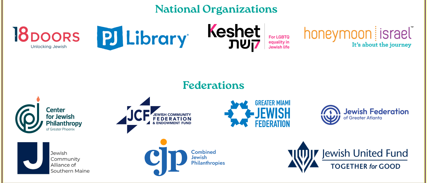
Figure B-1: Recruitment Partners

social media, or in a designated email invitation). The screener began with basic eligibility questions (to make sure respondents had children and were raising them with Jewish experiences). Those who were eligible were then shown additional questions designed to capture the information needed for sampling and scheduling purposes. As noted above, individual interview participants were recruited directly from the focus group sample, and their selection was guided by both what participants had shared initially in focus groups and the questions that emerged from our initial analysis of focus group data.